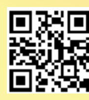
Westminister QR Code